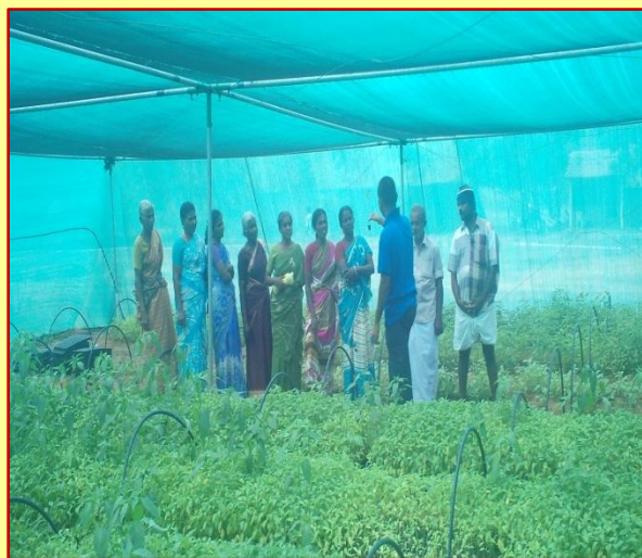
Sustainable agriculture training Programme to small and marginal farmers