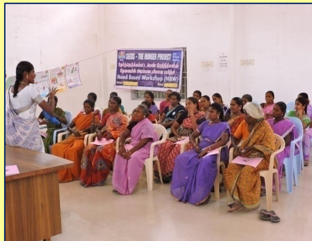
During the need based workshop