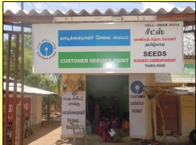
Our CSP center at Tamilpadi