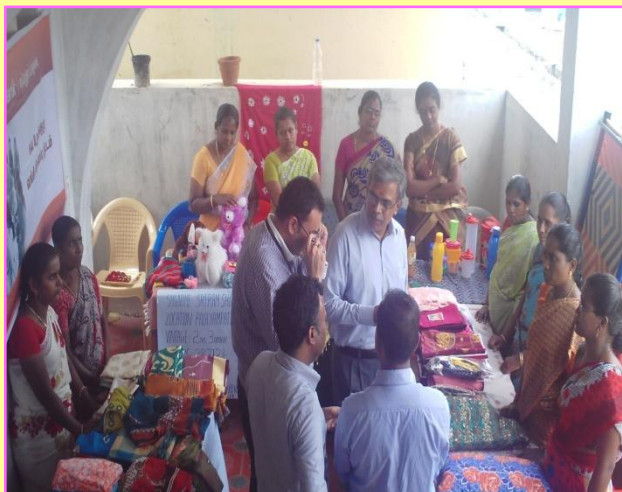
During the Visit to SHG members activities

In the exhibition, the women members put their products like big shoppers bags, Ornamental jewels, Fruit Juices, Aari and embroidery works in sarees and other dress materials etc. which spoke on the skill and knowledge of the SHG members.