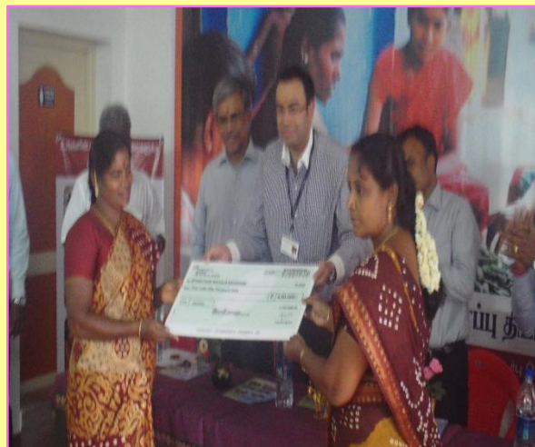
Distribution of Loan to Bharatham SHG by ICICI