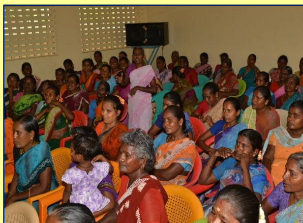
During the one day awareness campaign programme for unorganized women labour supported by Ministry Of Labour & Employment, New Delhi