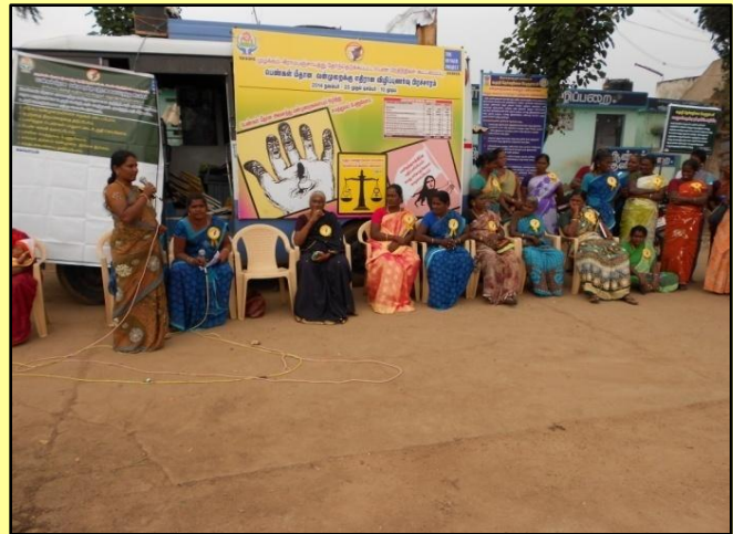
VAW Mobile Van Campaign Programme