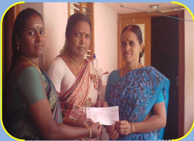
Artisan receiving health benefits

In the reporting year, a baseline survey was completed in Aruppukottai and Kariyapatti Block to find out the potential Women Artisans in Hand Embroidery. Through the survey Seeds selected 305 women artisans and ID cards and health cards issued to them. Further we plan to provide skill development training and Design Development workshop to the selected participants to enhance their skill in the latest embroidery design. Under the RGSSBY scheme, 9 artisans got insurance benefit for the amount of Rs. 22379/-