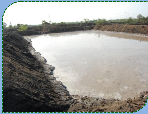
Before and After formation of Farm pond