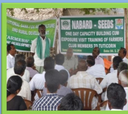
Farmers Exposure & sharing with progressive farmers

Now SEEDS proposes the UPNRLM (Umbrella Program in Natural Resource Livelihood Management) under the support of NABARD. We made a base line survey on the land holders and landless around the watershed villages and selected 125 persons among the vulnerable section and plan to cover them under the UPNRLM project. The main intention is to improve the livelihood and economic status of the peoples around the watershed area.