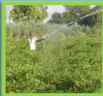
Usage of sprinkler by our farmers