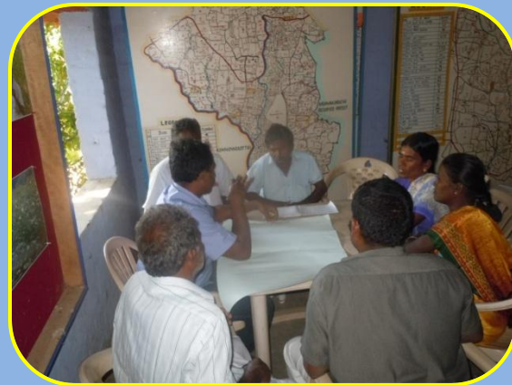
During farmers capacity building and exposure to Ottapidaram village