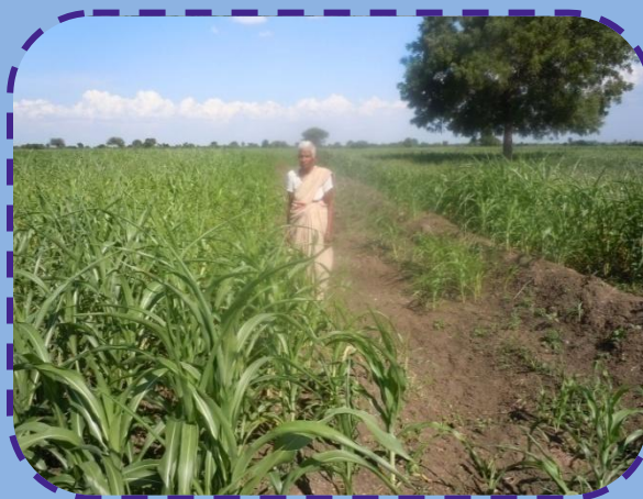
Before and after formation of Filed bunds