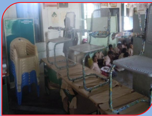
Provision of Furniture to Sempatti School