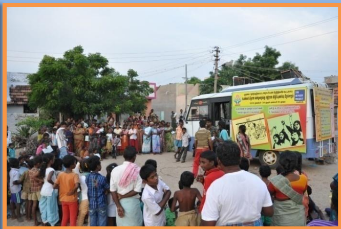
Violence Against Women – Vehicle Campaign