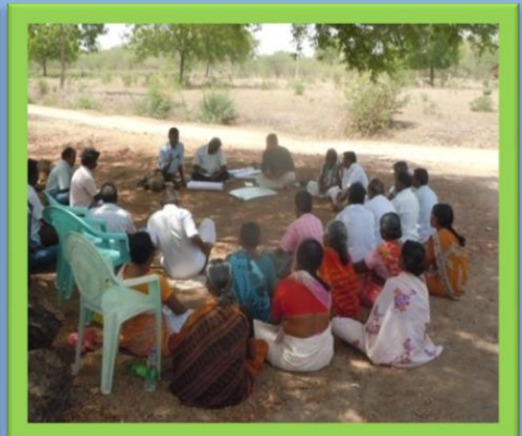
vwc meeting at Alagianallur village