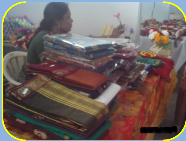
Participation in Craft Bazar at Madurai Thamukkam