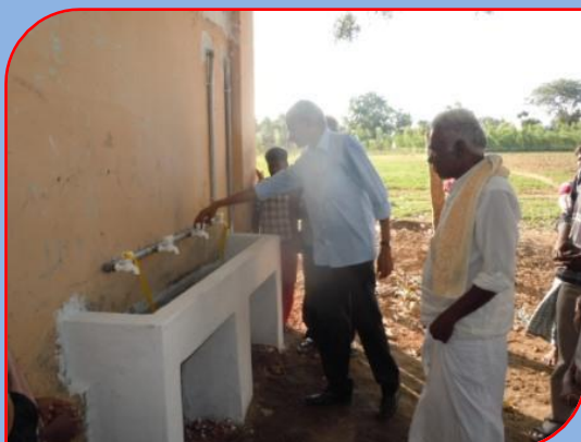
Inauguration of Water Tank in Chitalankundu School