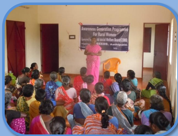
Awareness Generation Programme