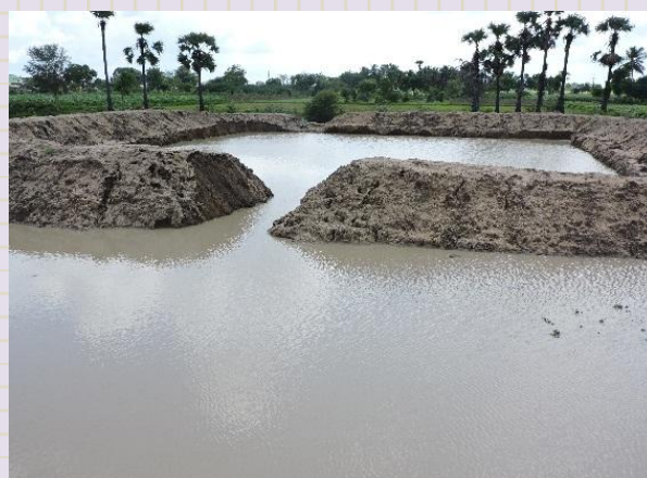
After formation of Field bund and Form Pond in watershed village