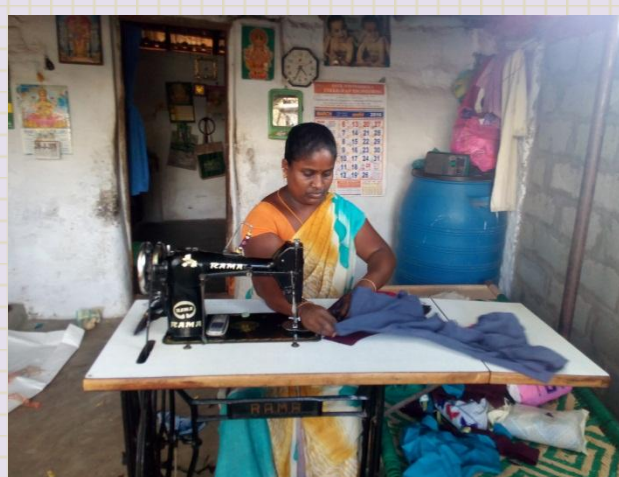
SHG members doing IGP through Micro Credit Support