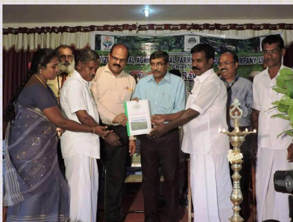
Puthur FPO inauguration at Thoothukudi

SEEDS efforts to enter in to mainstream markets showing good result. In the year 2015-2016. SEEDS procured agriculture commodities like millets, pulses chilies, maize directly from the farmers at their door step. Farmers get average Rs.5 per kilo over and above the price fixed by the local traders.