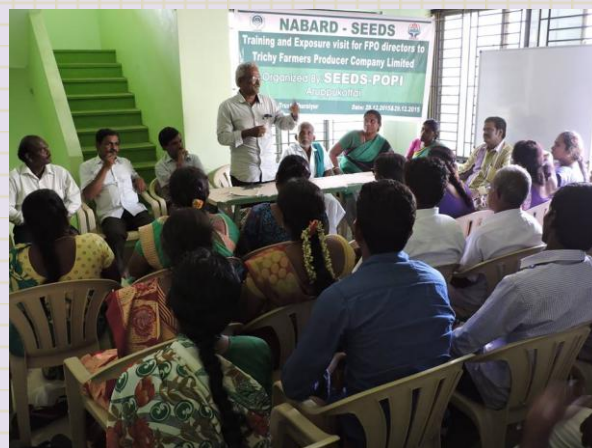
POPI training programme at Trichy FPO